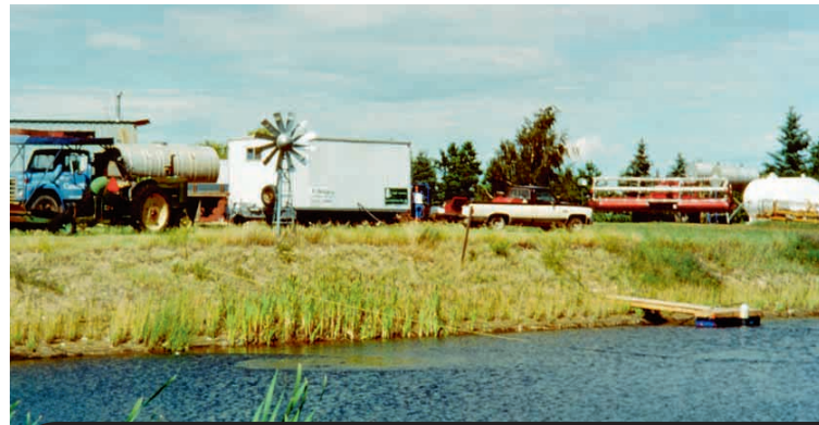
The mobile treatment trailer was parked beside a dugout and water was pumped from a portable intake secured to a floating dock

Specifically, the systems were studied to see how well they removed DOC, colour and turbidity from the water.