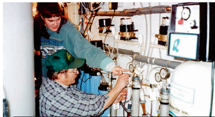
Technicians sampled water weekly to judge the performance of each treatment system inside the trailer